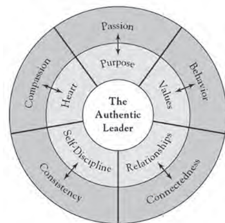
Figure 1. The Authentic Leader's Characteristics

Source: George (2003). Authentic Leadership: Rediscovering the Secrets to Creating Lasting Value , p. 36.